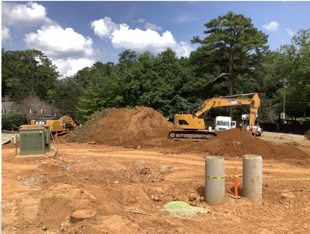
Building pad grading