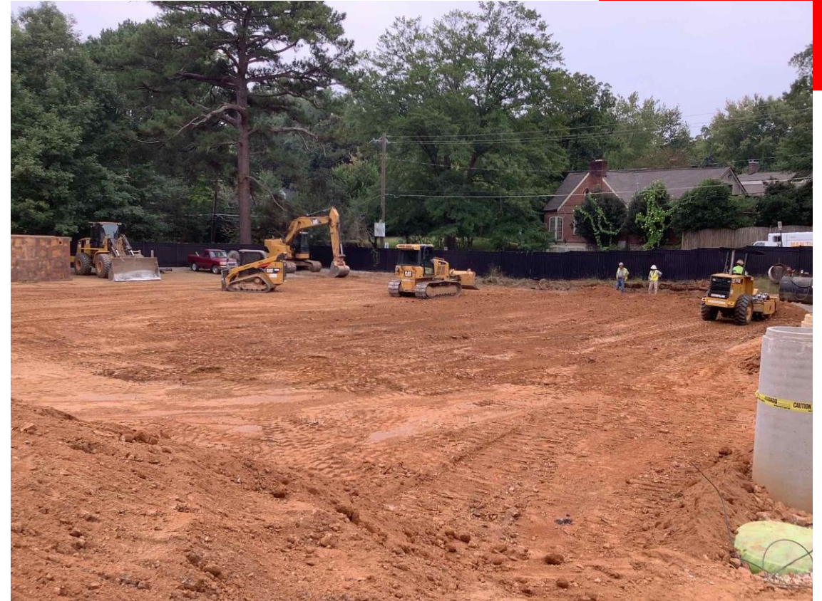
Building pad grading complete