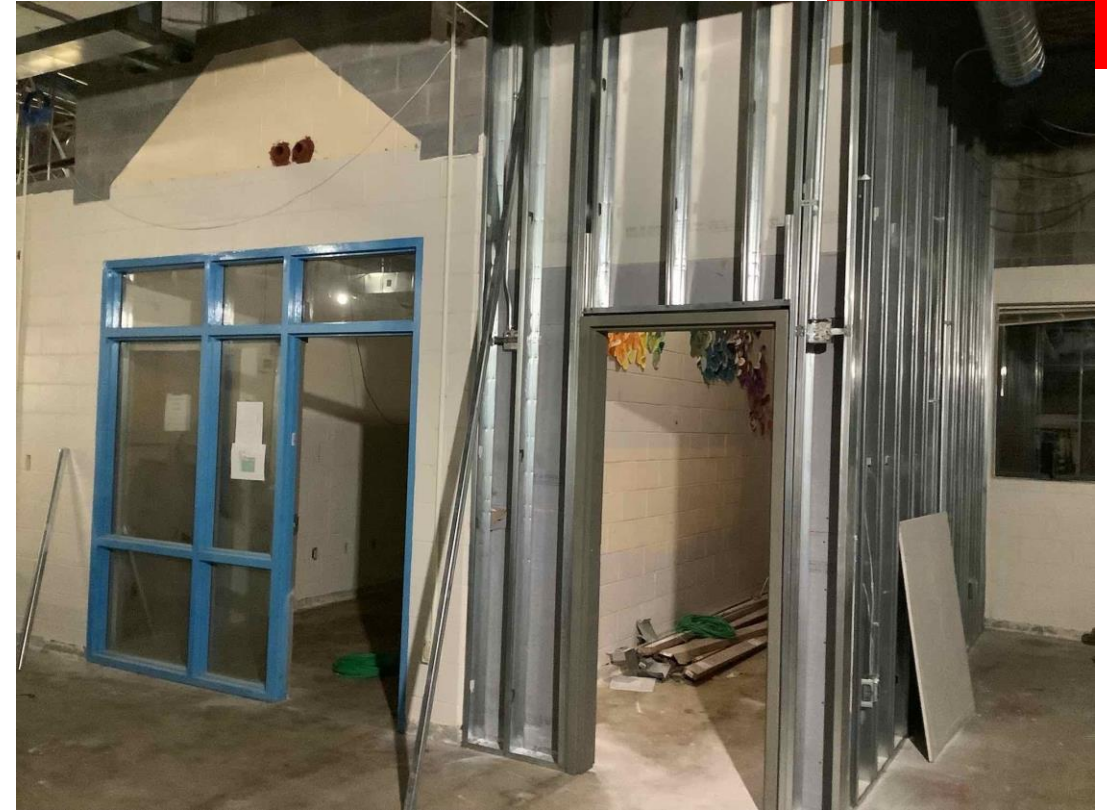
Interior framing at media center